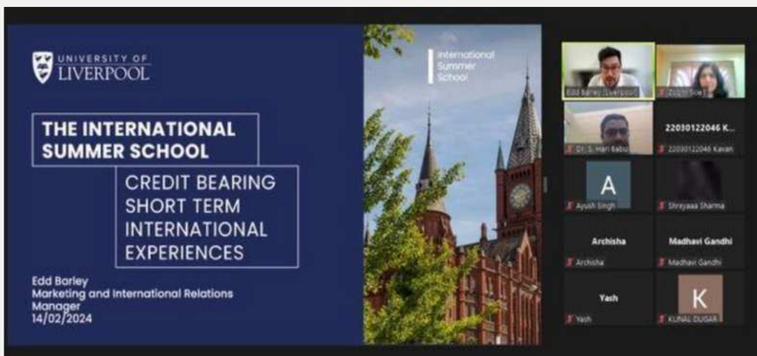
University of Liverpool conducting an information session for the upcoming Summer school