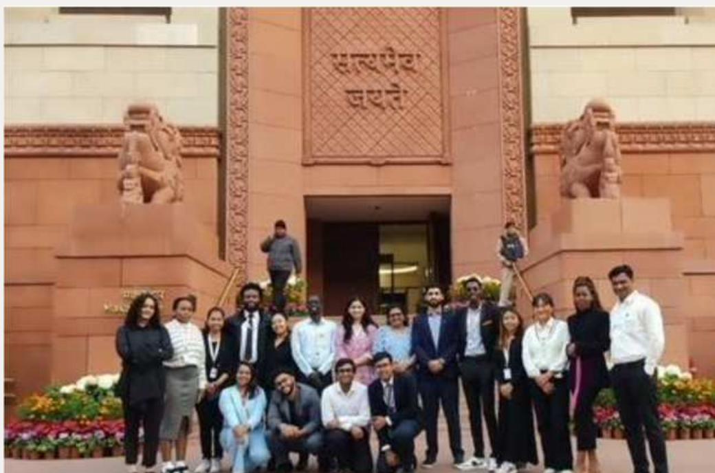
Symbiosis International Council members visited Taj Mahal, a renowned tourist attraction in Agra, which is a UNESCO World Heritage site.