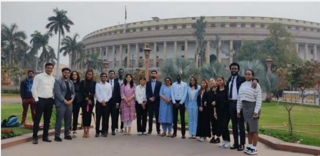
Symbiosis International Council members in front of the political powerhouse of India, The Indian Parliament, during their Delhi tour, in February 2024.

The students visited the 'World Book Festival' at the Bharat Mandapam, Prime Minister Museum, Parliament, India Gate, Taj Mahal in Agra – a UNESCO World Heritage site, Ministry of External Affairs (MEA), Janpath & Sarojini nagar market, Tamil Nadu and Maharashtra Sadans to explore and experience India historically, politically, culturally and through its rich cuisine.