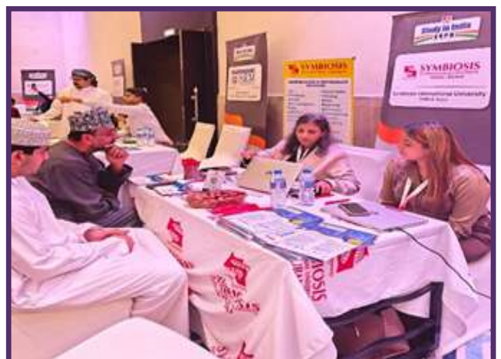
Oman Fair: Inaugurated by Shri Pradeep Kumar – Consulate General, Indian Embassy in Oman