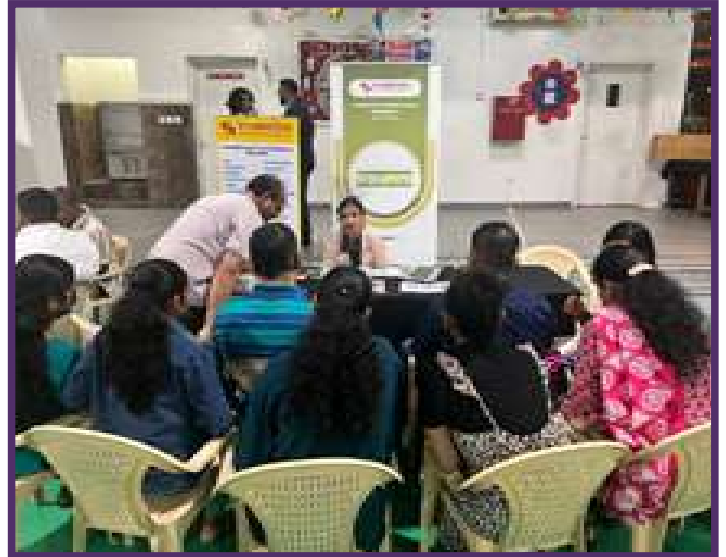
Qatar Fair: Inaugurated by the Principal of MES School

The primary objective of the education fair was to strengthen Symbiosis brand and visibility in these countries and to highlight the wide range of degree programs and offerings, attract potential students, and build meaningful networks with key stakeholders such as schools, institutions, educators, and service providers.