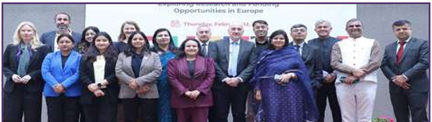
Symbiosis International (Deemed University), Noida Campus, welcomed the Delegation of the European Union to India and Euraxess India along with diplomats and officials from the Czech Republic, Finland, Hungary, Italy, France, Germany, Poland, Slovenia, and Switzerland for the “European Union Research & Innovation Information Day” on 12th February. The event highlighted EU–India collaboration in Research & Innovation, with a special focus on Horizon Europe, Erasmus+, research funding, mobility, and academic partnership opportunities.