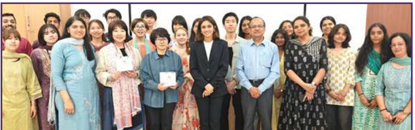
10 students from Chiba University, Japan, along with 2 faculty members, came to SIU under the GRIP program for a 10-day SIP. The SIP was facilitated by SCIE along with support from Symbiosis Community Outreach Programme and Extension (SCOPE) and Symbiosis Centre for Climate Change and Sustainability (SCCS).