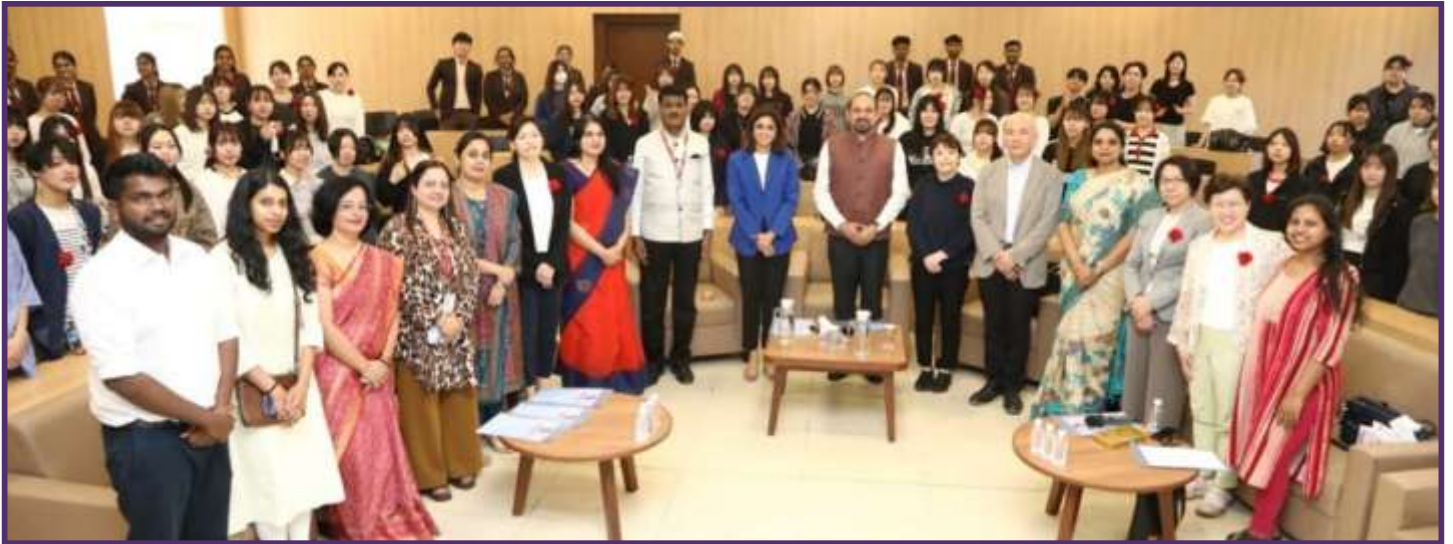
80 students from Jousai University, Japan, along with 4 faculty came for a 1-week SIP from 22 to 28 Feb 2026. The SIP was facilitated by SCIE along with support from Symbiosis College of Nursing (SCON).