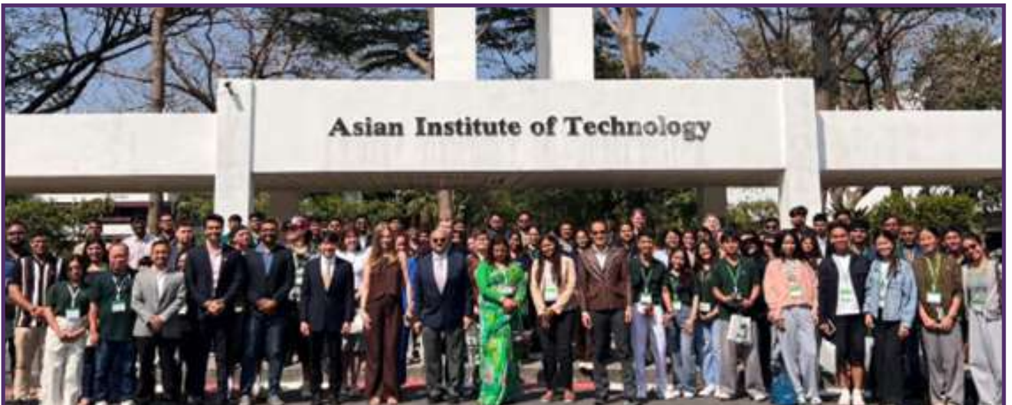
17 students from Symbiosis Institute of Business Management (SIBM) - Nagpur, Symbiosis Institute of Management Studies (SIMS), SIBM - Noida, Symbiosis Centre for Management Studies (SCMS) - Noida went to Asian Institute of Technology (AIT), Thailand for a Study tour for 1 week.