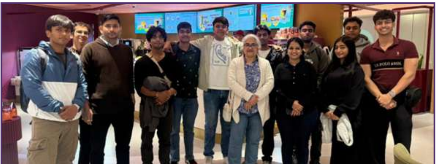
10 students from Symbiosis Institute of Technology (SIT) - Pune, Civil Engineering visited SIU Dubai for the Study in Dubai, Civil study tour.